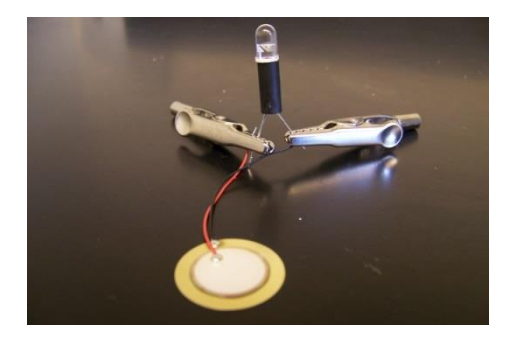
Figure 3. Piezoelectric disk ready to be tested

3. Connect 1 LED to a piezoelectric ceramic disc so that the long wire of the LED is connected to the red wire coming from the disk and the other wire of the LED is connected to the black wire of the disk.