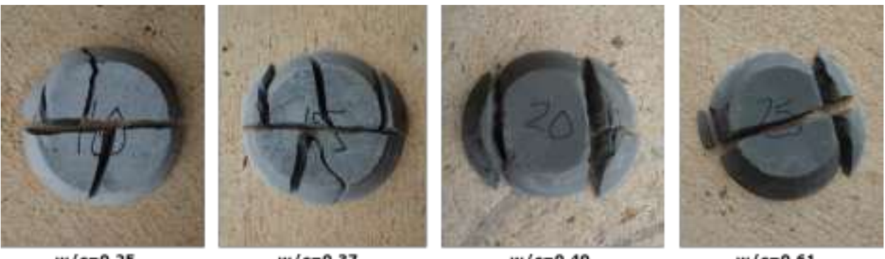
w/c=0.25 (10 spoonfuls)