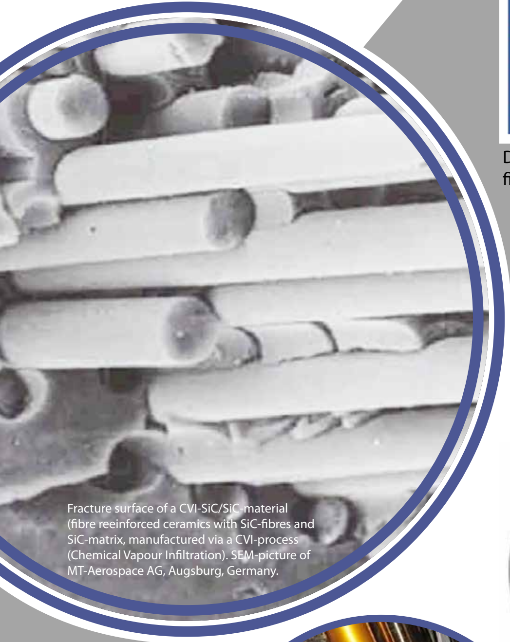
Fracture surface of a CVI-SiC/SiC-material (fibre reinforced ceramics with SiC-fibres and SiC-matrix, manufactured via a CVI-process (Chemical Vapour Infiltration).

CMCs are used in some aircraft engines such as the new GE9X.