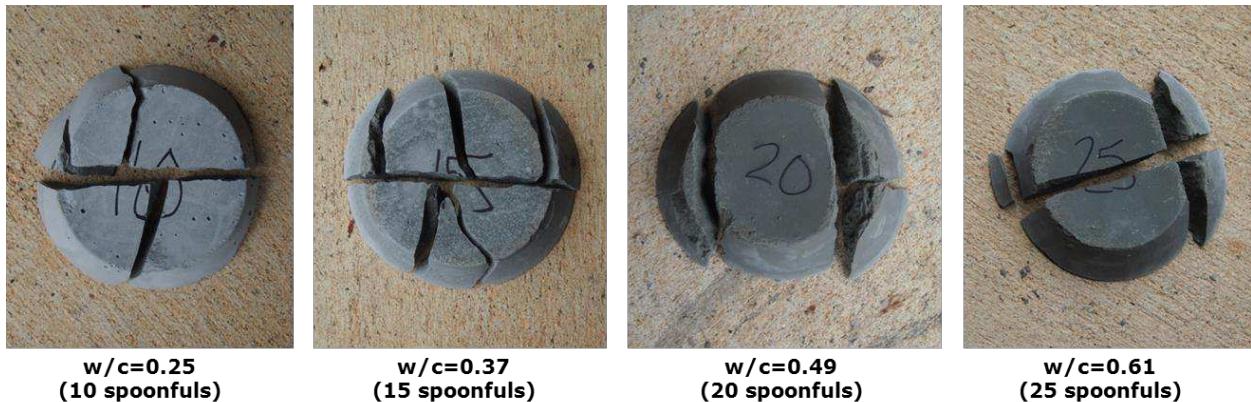
Figure 2. Pucks with different w/c ratios after dropping from a height of at least 15 feet.