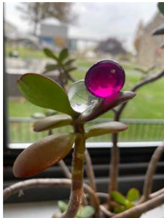
Figure 1. Water pods produced with both no food dye as well as red food dye, resulting in dramatically different colors. These spheres are great representations of glass encapsulation and formation.

Supplemental Link: https://www.wikihow.com/Make-Edible-Water-Bubbles