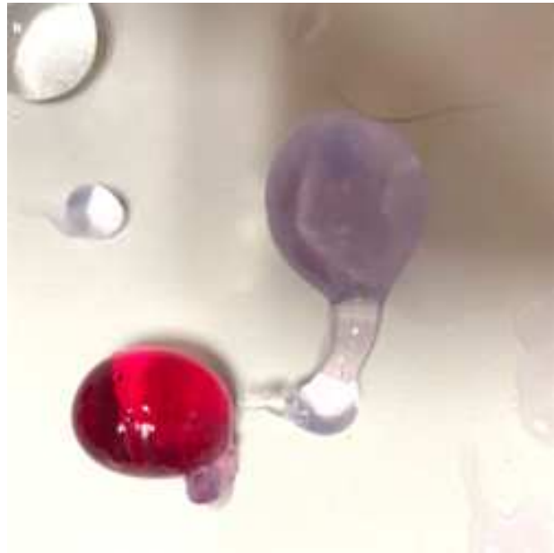
Figure 4. Beads can be produced in a wide variety of conformations. By changing the size of the dipping spoon, altering the dipping pattern, or using molds, a wide variety of shapes can be made.

Bioactive glass beads are unique in that they are capable of releasing and delivering large drug molecules to specific points in the body. Their composition allows scientists to functionalize the surface of the beads, which can have a variety of effects, such as allowing them to circulate in the body longer, target specific regions or cells of the body, or bind more effectively to a target. Additionally, glass beads are robust, and can survive for longer periods of time within the body before breaking down. This could allow drugs to circulate longer internally following a single dose.