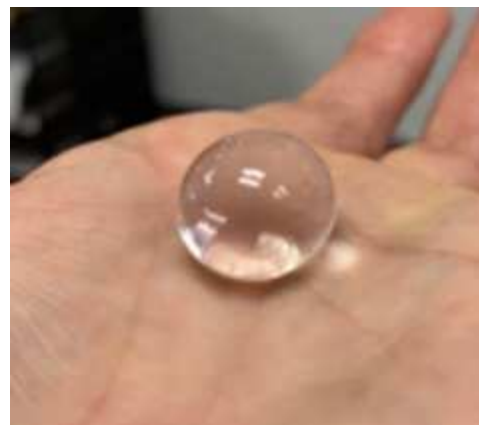
Figure 2. Water pods are safe to handle, are 100% edible, and are easy to make. Connecting this lesson to others such as optics is easy as well. For example, ask students to consider how light may bend through this sphere, and how its contents could affect this.